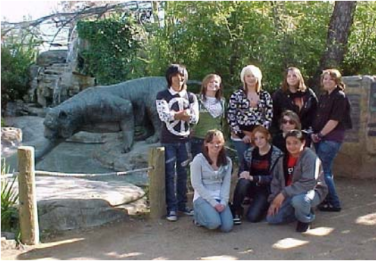
Teens at Work